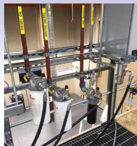
LMP 210 in-line filters and MPS Spin-on for diesel, engine oil, adblue fluid