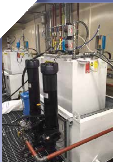
Hydraulic reservoirs with LMD 431 in-line duplex filters

LMD 951 series installed on the entry to the bulk oil tank - oil deliveries from the supplier are filtered with a single pass through the duplex filter