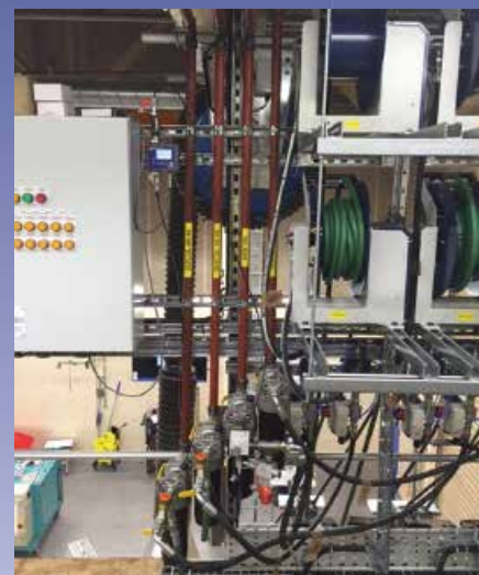
Fluid hose reels with ICM particle counter