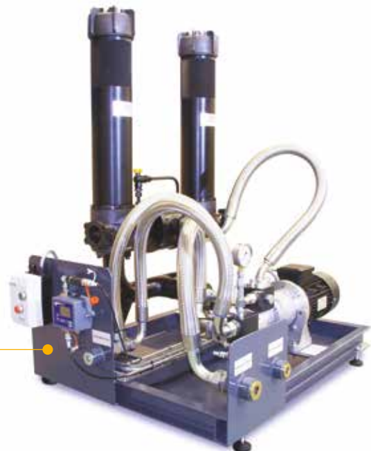
Bulk storage tank filtration system with ICM & control box