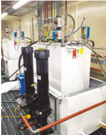
Hydraulic reservoirs with LMD 431 in-line duplex filters