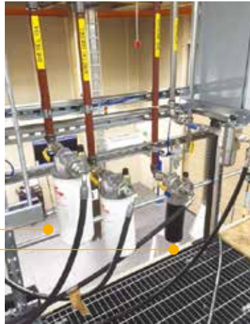
LMP 210 in-line filters and MPS Spin-On for diesel, engine oil, adblue fluid